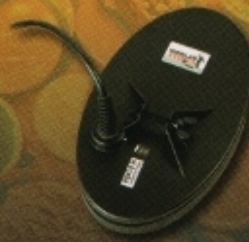
5" x 10" 18.75kHz elliptical DD coil