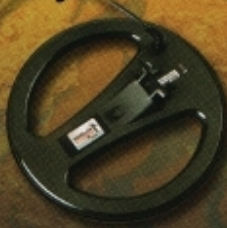
10" waterproof 7.5kHz DD coil or 18.75kHz DD coil