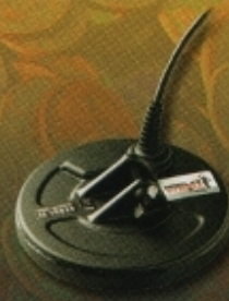
6" - 7.5kHz Concentric coil 6" - 18.75kHz DD coil