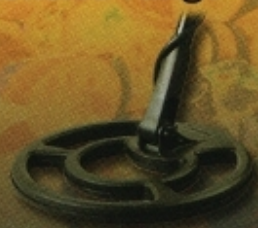
9 inch Waterproof Concentric coils available in 3kHz, 7.5kHz and 18.75kHz.