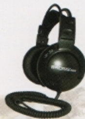
Koss Headphones (100 Ohm)