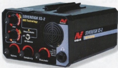
Sovereign XS-2 Control Box