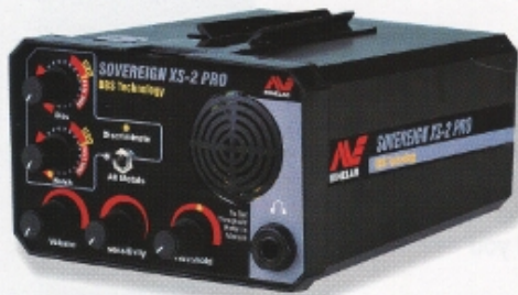
Sovereign XS-2 Pro Control Box