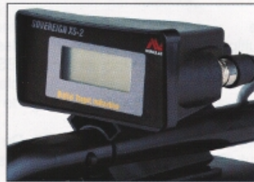
Digital Target Indication meter