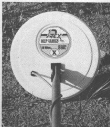
Three search coils are available including eight, 10, and 14 inch sizes.

The meter on the Coin King CK-20 is large and easy to read. It is clearly marked for battery testing, and gives a visual indication on targets. The detector case is perfectly flat on the