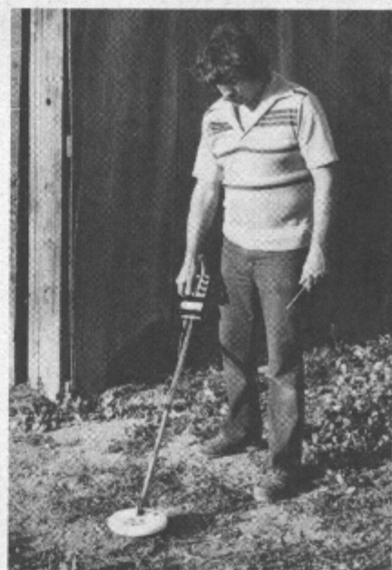
The D-Tex Coin King CK-20 is compact, light weight, and extremely well balanced.

bottom, eliminating the need for bulky "stands" to keep the unit from tipping over when you lay it on the ground to dig.