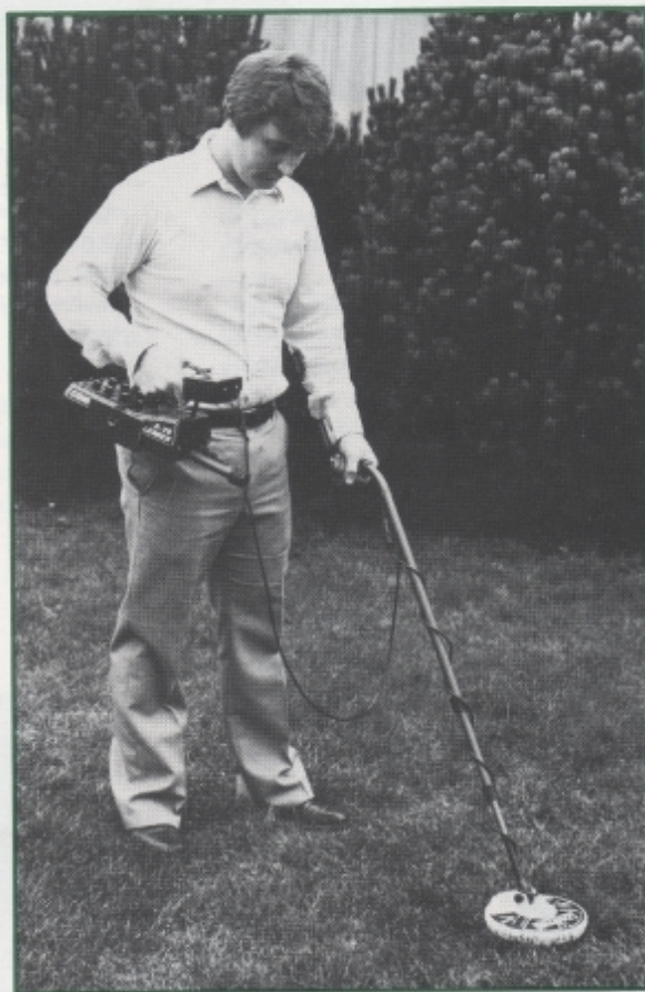
Hip Mount Platform Conversion Kit