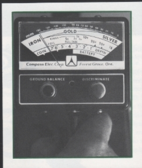
Back-lighted Meter for Night Operation (Kit Form, Easily Installed)