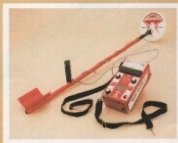
RB 7 HIP MOUNT MODEL