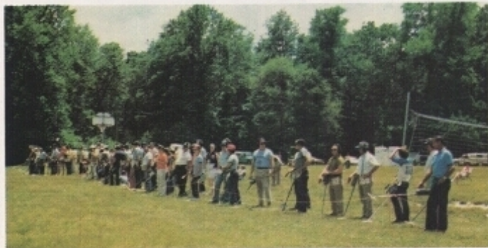
Treasure hunters lined up for the opening of competitive treasure hunt.

AUTOMATIC TUNING — A metal detector feature which allows the unit to constantly re-tune itself to maintain the "THRESHOLD" of sound, that point at which the sound "just starts" when tuning a TR or VLF type unit. When tuned to this point, the detector has its maximum sensitivity (depth of penetration). The advantage of automatic retuning is that the unit is constantly peaked in sensitivity without the operator having to "ride the pushbutton". Fully automatic tuning is especially advantageous when operating in the wet sand on an ocean beach. As the wet salt (which is conductive) tries to change the tune of the detector, the detector can automatically compensate, maintaining stability.