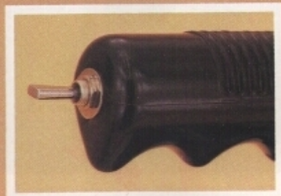
ALL METAL/DISCRIMINATE MODE SWITCH & RETUNE BUTTON.

COMPLETE SINGLE-HANDED OPERATION: The All-Metal/Discriminate mode switch and retuning button have been combined into one control in the handle.