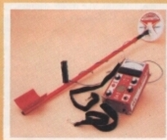
RB 5 HIP MOUNT MODEL